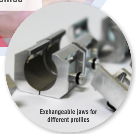
Exchangeable jaws for different profiles